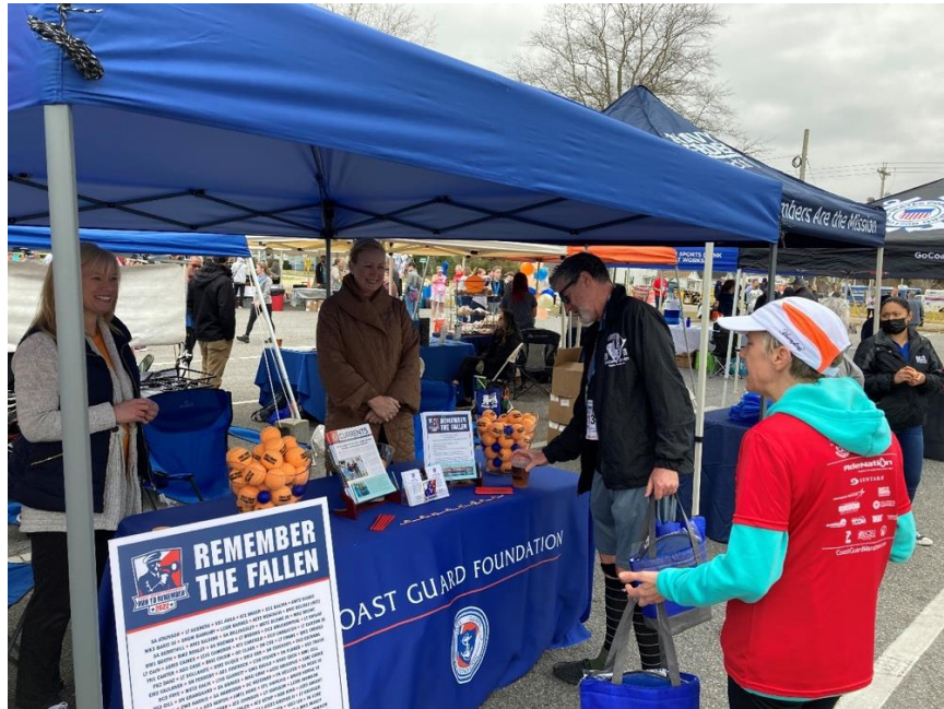
The Coast Guard Foundation participated in the Marathon Expo and Race Day activities.

The Coast Guard Foundation is committed to ensuring all Coast Guard members and families have the resources they need to build resilience throughout their lives. Founded in 1969, we're a vital partner to the Coast Guard—tackling the toughest challenges confronting our heroes and strengthening the entire community. Coast Guard members sacrifice so much to protect our nation. We must stand together and show them our appreciation so they can remain always ready. Join us at CoastGuardFoundation.org .